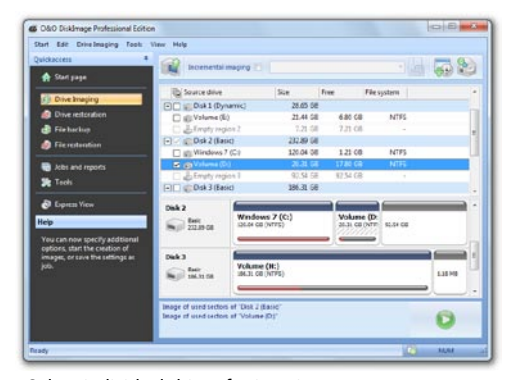
Select individual drives for imaging