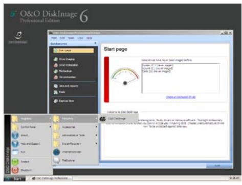
Start O&O DiskImage directly from Bootmedium