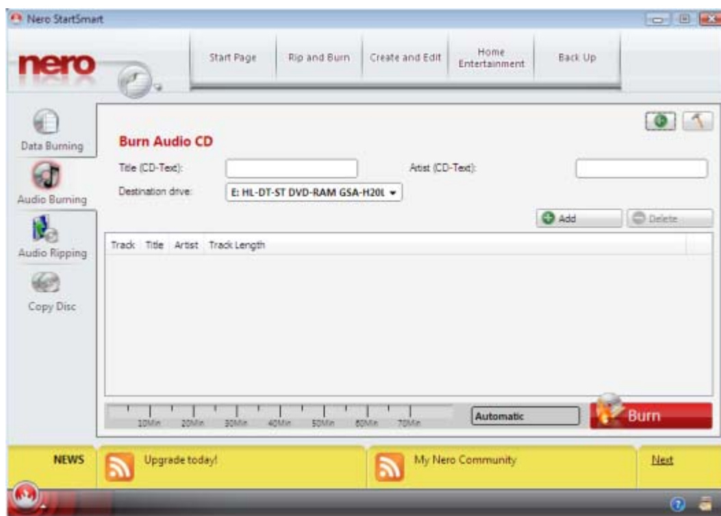
Burn Audio CD screen